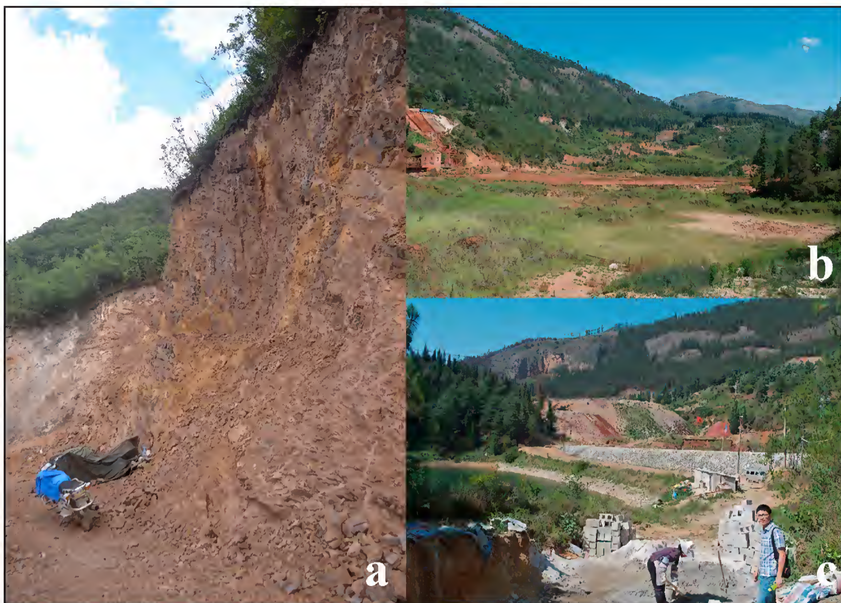
Figure 6. Habitat destruction of Tylototriton yangi in southern Yunnan Province, China. a) Coal mining site at Yangjie, Mengzi, Yunnan Province, China; b) illegal tin mining at the type locality of T. yangi in Gejiu, Yunnan, China; c) Deforestation and infrastructure constructions at the type locality of T. yangi in Gejiu, Yunnan, China.

sources were occupied by newts during the duration of this study (e.g., the reservoir, and PBP#10, PBP#15, and PBP#16), and some pools (e.g., PBP#13 and PBP#14) were used by more newts than the others. These differences in pool use may be due to ecological factors such as nearby canopy coverage, amount of aquatic vegetation, water depth, food availability, and predation risk. We found the most newts in deep pools (30–50 cm in depth) with no large aquatic predators (e.g., large fish), some but not dense aquatic vegetation and dense surrounding terrestrial vegetation. These may be key factors for breeding site selection by T. yangi . Further studies are needed to determine the details of factors that affect breeding-site selection.